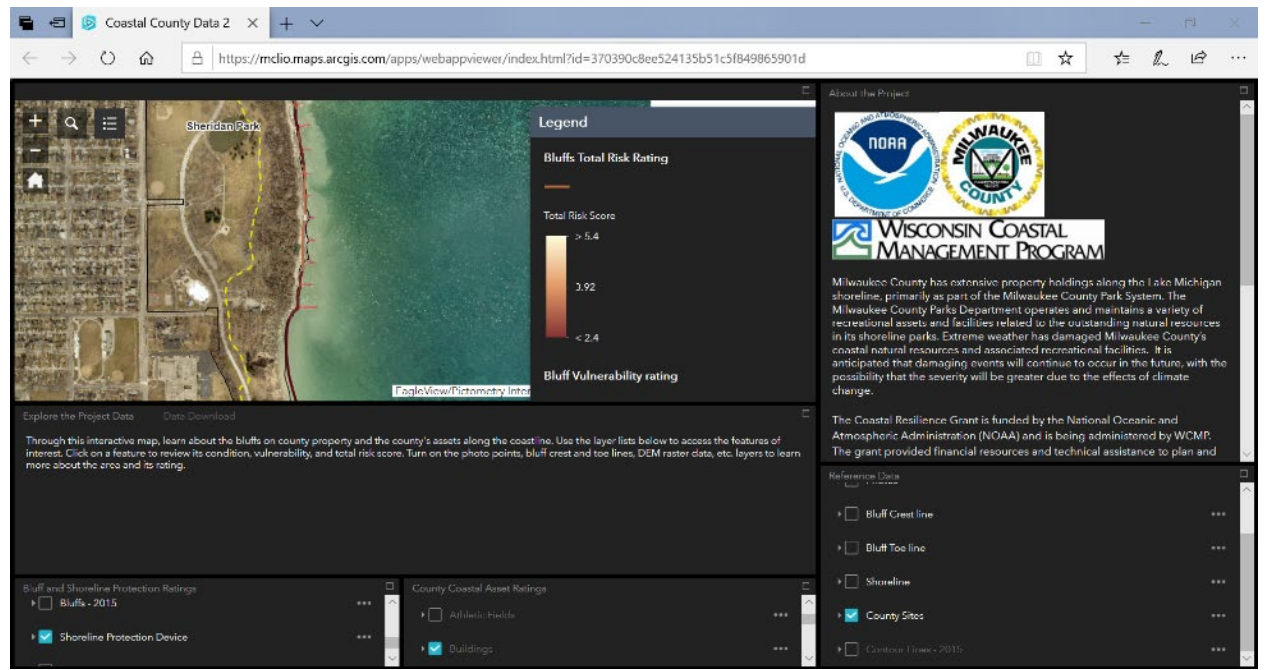
Figure 6: Screenshot of Milwaukee County Coastal Resources Inventory Interactive Map

Links to this publicly available data are available at: <u>Geodatabase link</u> Interactive map link